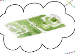
A Football Pitch