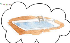
A Swimming Pool